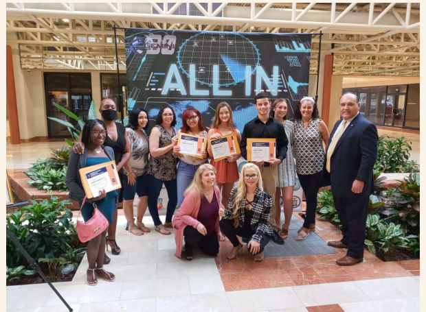
Course of Action Foundation Scholarship recipients